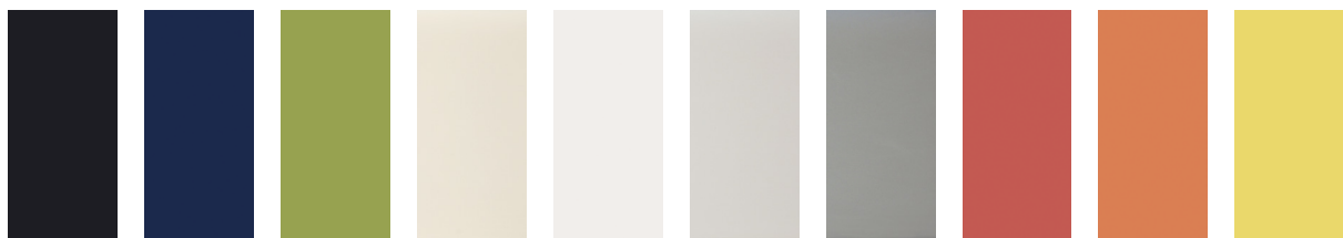
black blue green bone white pearl gray red orange yellow

*Reach out to your Audrey Lane rep for additional color options