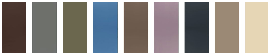
brown silver salvia ocean nut mosto graphite beige almond